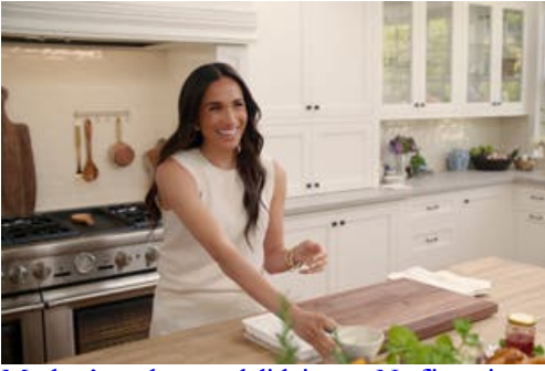
Meghan's nod to royal dish in new Netflix series trailer